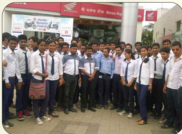
Two Wheeler Workshop at Rajendra Honda, Sangamner