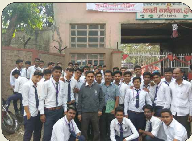
Visit at Central ST workshop Dapodi, Pune