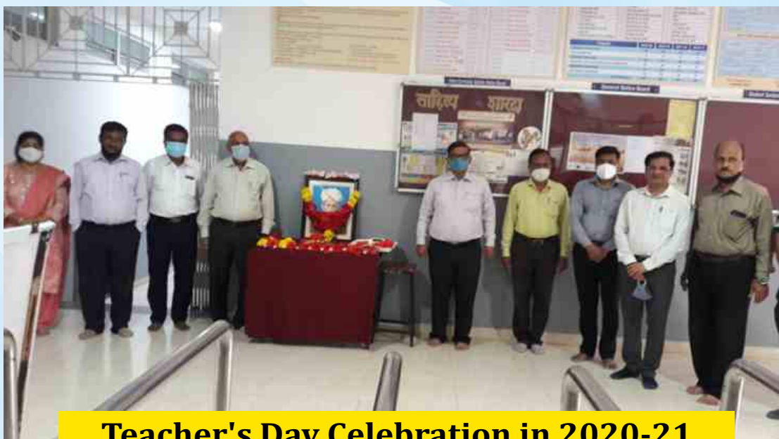
Teacher's Day Celebration in 2020-21